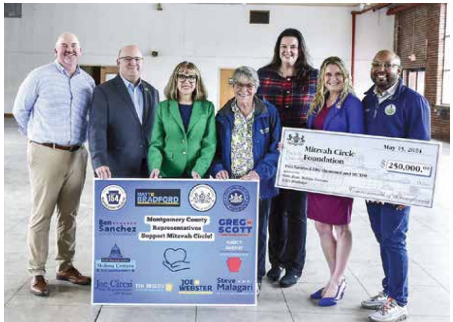
Montgomery County state representatives joined Mitzvah Circle to celebrate a $250,000 state grant to help renovate their new location in Montgomery Township.